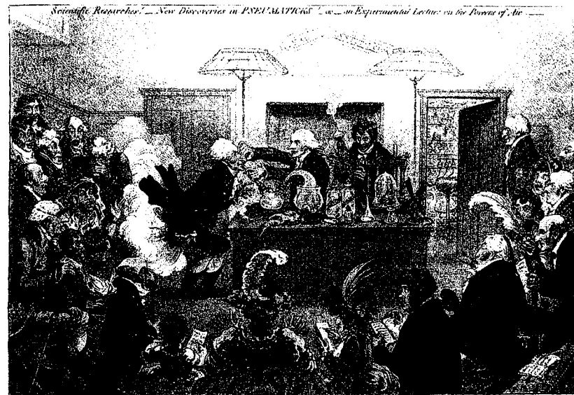
FIGURE 3.3 "Scientific Researches!" by James Gillray (NPG D13036;). Pneumatic experiments at the Royal Institution, satirized by James Gillray. The Royal Institution's professor of chemistry, Thomas Garnett, is administering gas to a member of the audience. The man standing behind him wielding a bellows and wearing a satanic grin is Humphry Davy. The gentleman with a large nose on the far right, looking on benevolently, is the institution's founder, Count Rumford.

Priestley's pneumatic chemistry had other connotations as well, however. Some of his supporters, such as the Oxford professor of chemistry Thomas Beddoes—a student of the Scottish chemist Joseph Black—felt that Priestley's discoveries could provide the basis for a new system of med-