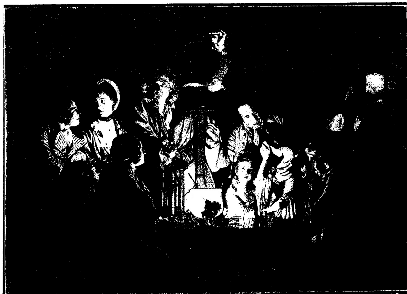
FIGURE 3.2 Joseph Wright's "Experiment on a Bird in an Airpump" (1768). A chemist demonstrates his experiments to a group of fashionable onlookers. The painting illustrates the increasing cultural importance of chemistry and natural philosophy during the eighteenth century.

the properties of one of these new airs by showing whether a bird could survive breathing it. The chemist is demonstrating the experiment to a group of well-dressed middle-class witnesses. The newly prosperous middle class was an important new audience for science during the eighteenth century. They were attracted by its utility and the lessons that might be learned by studying the order of nature. In the hands of radical natural philosophers and chemists such as Joseph Priestley even the chemistry of gases could be shown to carry important political messages. It was also a source of new technologies and played a key role in transforming the language of chemistry at the end of the century.